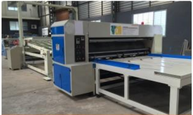
ROTARY DIE CUTTER ATTACHED SLOTTER