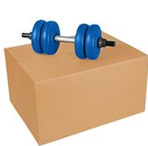
275 Lb. Single Wall