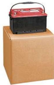
275 Lb. Double Wall