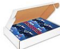
Tab Lock - White