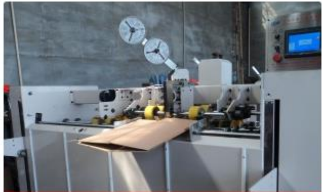
SEMI AUTOMATIC BOX STITCHING MACHINE