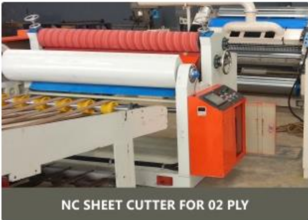
NC SHEET CUTTER FOR 02 PLY