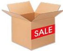
30 Best Sellers