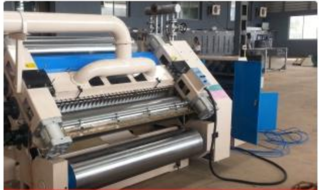
CORRUGATION MACHINE - FINGERLESS MODEL