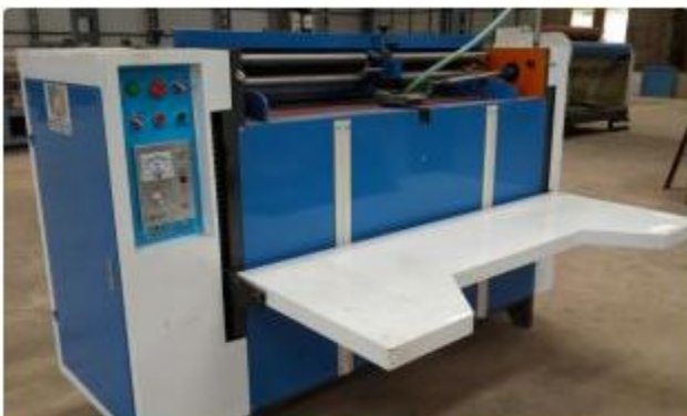
MANUAL FLAP PASTING MACHINE