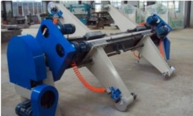
SHAFTLESS REEL STAND - ELECTRIC