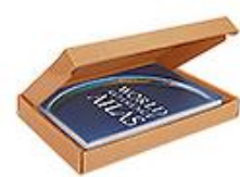
Tab Lock - Kraft