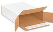
Easy Seal Side Loaders