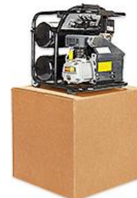
500 Lb. Double Wall